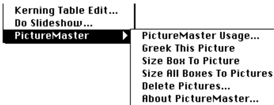
Figure 1: The PictureMaster Menu

Using Lepton PictureMaster couldn't be easier. PictureMaster's features are accessed via the PictureMaster submenu, located under the Utilities menu. Pull down the Utilities menu and drag the mouse over the PictureMaster menu to access its features, as shown here: